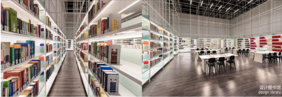
Figure 4: Interior View of Design Library

With "creation" and "design" as major entry points, the Design Library strives to integrate specialized collections and resources and build a service platform for cultivating innovative ideas and incubating curiosity and creation. In addition to regular general readers, the library also serves the users of creative industries, providing them with access and reading services for art and design literature, design databases searching and downloading, cutting-edge intelligence consulting services, outstanding product exhibition, case studies presentation, and other design-related services. The space has a floor area of about 700 square meters, consisting of Documents Area, Joint Office Area, Inspiration and Creation Space, Exploration and Production Area, and Conference Room. Two 140-square-meter multi-functional halls are symmetrically set up on the north and south sides of the main building, namely the Product Launch Hall and the Design Exhibition Hall.