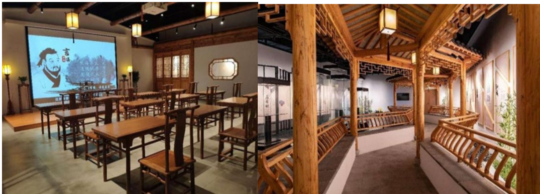
Figure 1: Interior of Suzhou Literature Library

The Suzhou Literature Library, themed around Suzhou literature, is a "library within a library" located on the fourth floor of the Suzhou Second Library. It spans an area of 900 square meters and houses a collection of 30,000 autographed books. The space design replicates the ancient halls of Suzhou Library's predecessor, Zhengyi Academy, with its Xuegutang and Yuqingtang halls serving as areas for reading and for traditional cultural promotion activities. Additionally, the library features a literature exhibition area that highlights the works of writers and cultural figures that are from Suzhou, signed editions by contemporary literary figures, and hosts small literary salons.