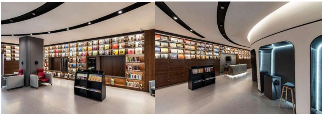
Figure 2: Interior View of the Music Library

The Music Library is "a library within a library" created on the basis of the music collections accumulated by Suzhou Library over a long period of time. The resources are developed with