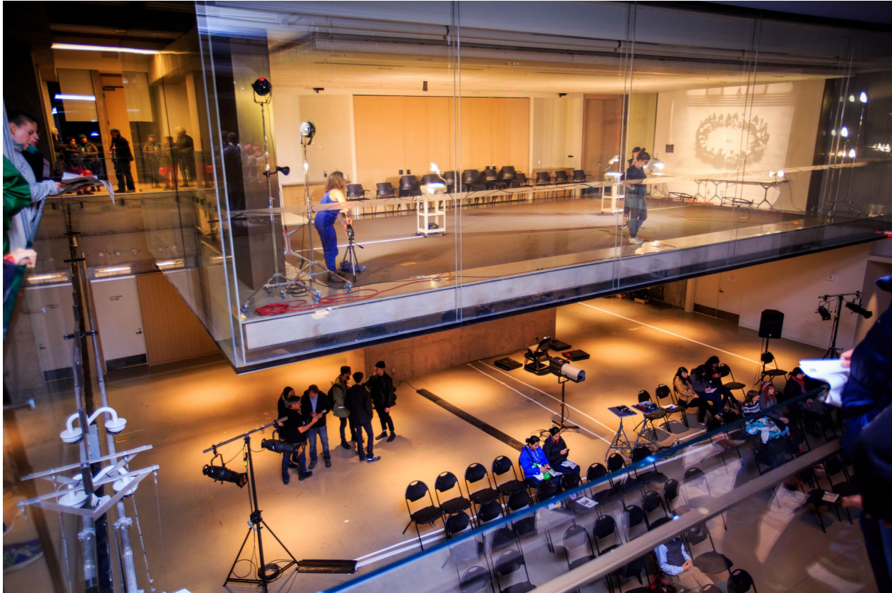
Ame Henderson: rehearsal/performance at Nuit Blanche, 2014.

Ame Henderson (August 5 – October 9, 2014)