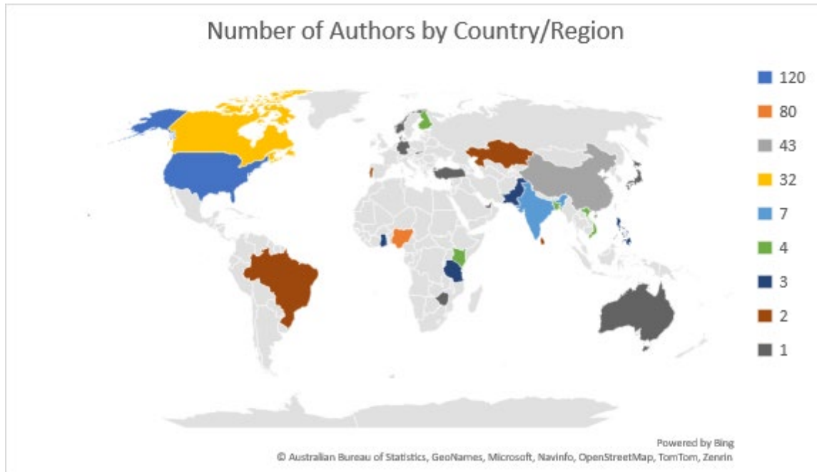
Figure 3. Author's countries or regions on the map of the world

In addition to Featured Articles, Reports from the Field, Reviews, Commentaries, the Editorial Board developed two columns unique to this journal, the LIS Education Around the World and the Library Associations Around the World. Articles published in the columns introduce related topics on an international scale, such as LIS education accreditation and practices in different countries, the International Federation of Library Associations and Institutions (IFLA) Journal and professional development, and Lebanese Library Association. ( IJoL , 2023) These columns help improve the diversity of this journal and the international connection among libraries and other related information organizations in different regions in the world.